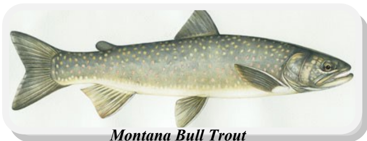
Montana Bull Trout